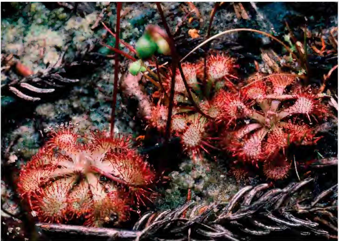
Figure 5: Plants of D. spatulata var. bakoensis growing in shaded locations have a less vividly red coloration.